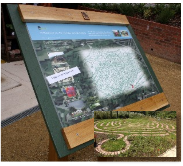
The Labyrinth with time capsule at centre in construction