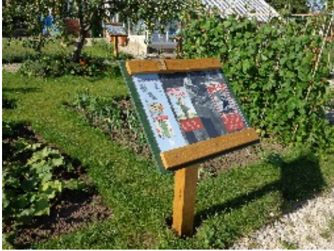
Easily changeable but robust graphics