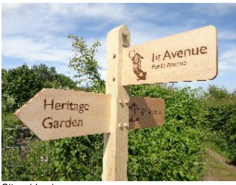
Site wide signage