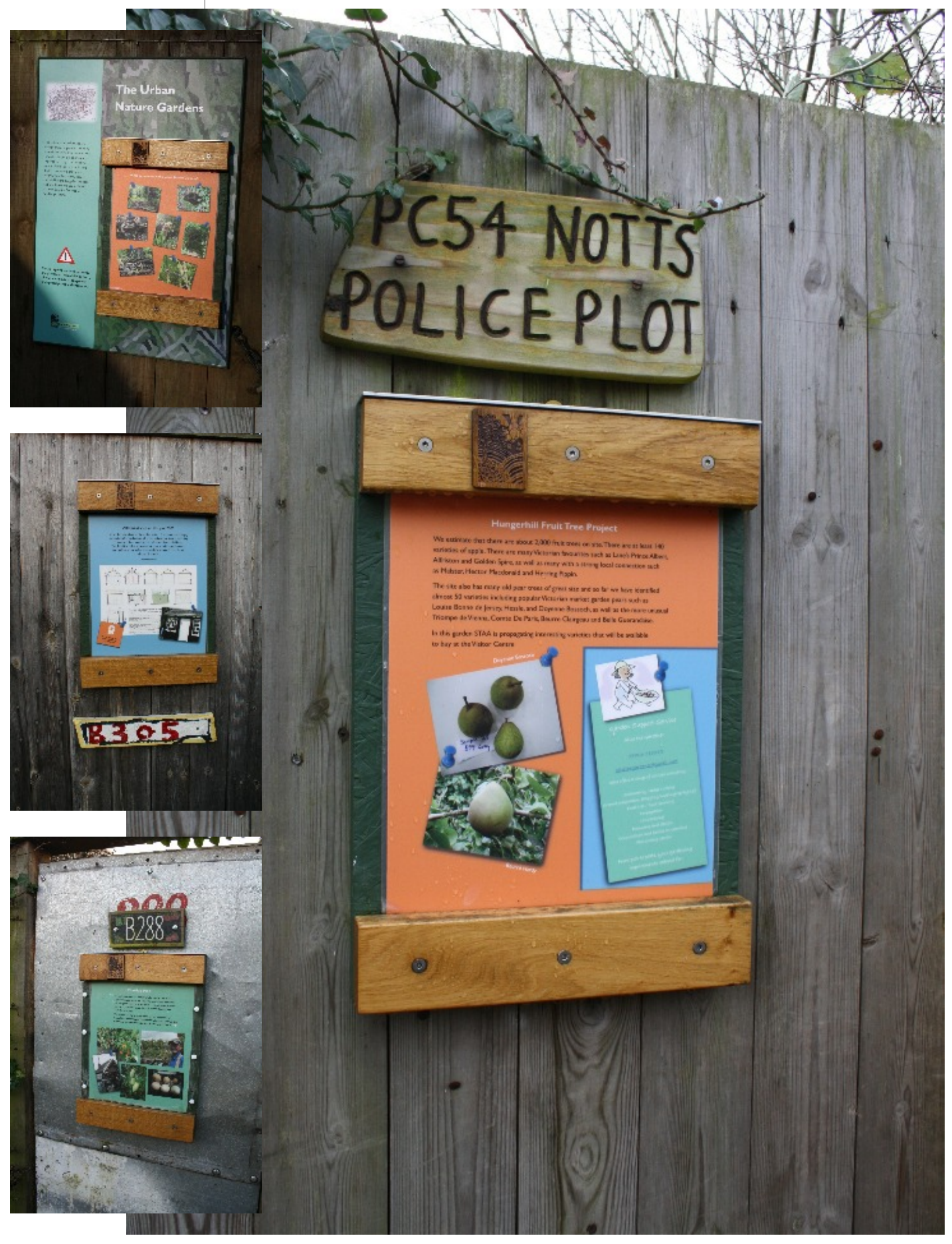
Allotment holders speak to other and new visitors on what going on behind the locked doors