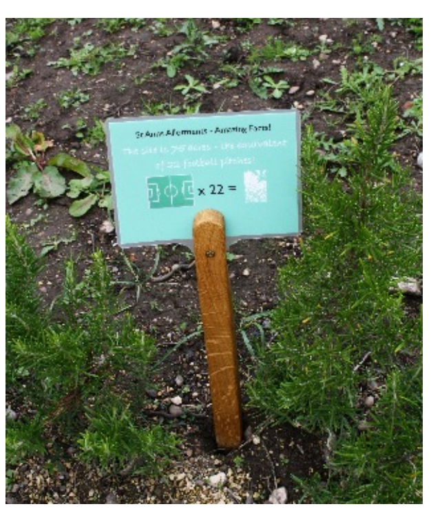
Amazing fact trail