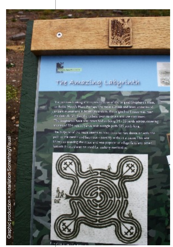
Robust matte laminated graphics cheap & easy to change